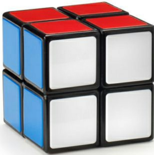
2 x 2 Puzzle Cube

The 2x2 Puzzle's Cube (also known as the pocket or mini cube) consists of 8 corner cubies and operates in much the same way as its bigger brother – the 3 x 3 Puzzle Cube.