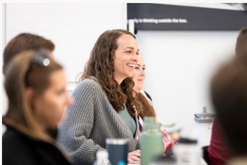
this is a caption for this pic

Best Workplaces in Manufacturing and Production rankings are determined by responses to the previous year's Great Place To Work survey, and this distinction is just one of many Great Place to Work awards and recognitions Arthrex has received already this year.