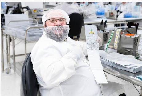
this is also a caption

https://aall.investorroom.com/2025-10-24-Arthrex-Once-Again-Named-to-Best-Workplaces-in-Manufacturing-Production-TM-List